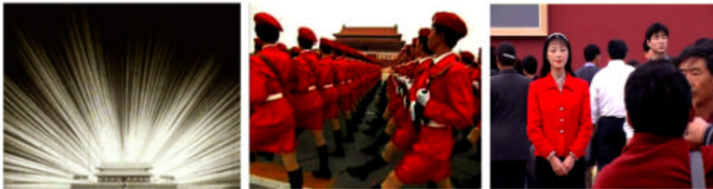
Video Stills of: Wang Jianwei, Square , 2003, 15.00 min, 1 Channel DVD, Beijing

The video Square depicts a careful analysis of the cultural-historic role of Marxism in structuring Chinese society, from the founding of the Peoples Republic of China in 1949 until the present day. It treats the camera as a recording device that captures the public behavior of ordinary citizens – many of whom come from the countryside – whilst they visit the national parade on Tiananmen Square in Beijing during the annual celebration of National Day, on October 1 st .