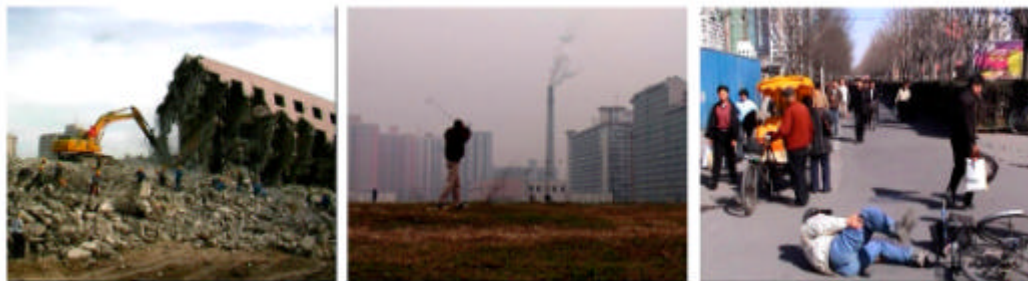
Video Stills of: Zhao Liang, City Scene , 2004, 23.11 min, 1 Channel DVD, Beijing, © Image: Courtesy of Zhao Liang

City Scene is one of Zhao Liang's most prominent video works to-date. It features an intriguing collection of scenes of everyday live in Beijing, which had been recorded over a period of 10 years, between 1994 and 2004. This work directs the viewer towards an understanding of the notion of xianchang , whereby the camera is capable of recording and transmitting the scenes of incidents , as they occur in time and space, and thereby determine social behavior in and around the rapidly growing city of Beijing.