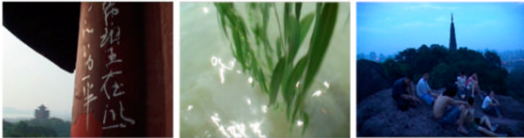
Video Stills of: Qiu Zhijie, Mountain, Water, River, Lake , 2005, 9.00 min, 1 Channel DVD, Hangzhou, © Image Courtesy of Qiu Zhijie

"On the peak of the Wushan Hill lies a pavilion from which you can see both the river and the lake". This video asks the question if what we see is real and involves a small group of students from the new media department of the China Art Academy in Hangzhou. Mountain, Water, River, Lake deals with the historical legends of the former Imperial Capital, which lies buried underneath the new City. It asks whether we need to be reminded of our cultural tradition through recreating historical sites and buildings or whether it is more important to nurture such traditions in one's heart.